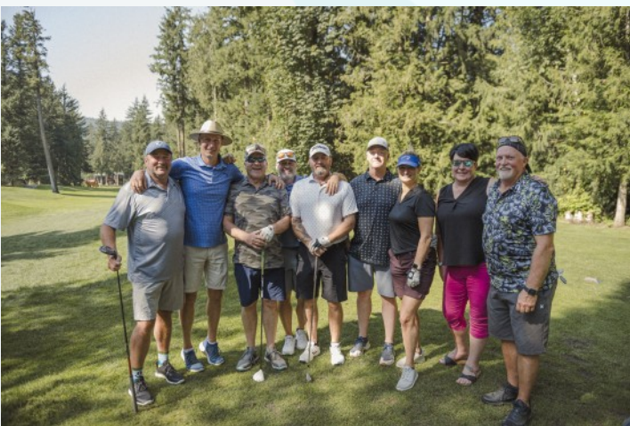
Good Friends! Good Times!