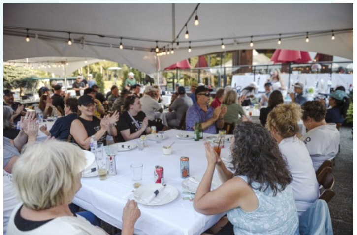
Post Game Dinner Packed with Smiles!