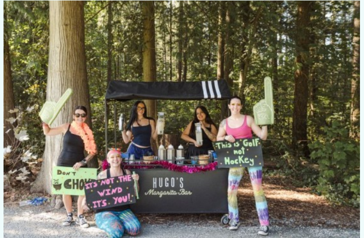
The Infamous “Hackle Hole”