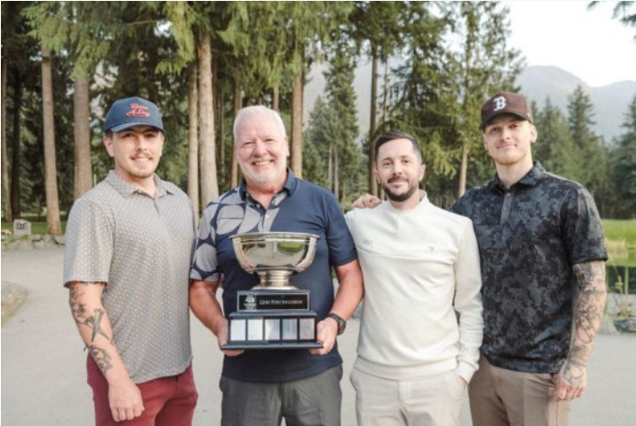
The Champs from Sweeney's Barber Shop

Save the Date: Join us on Wednesday, September 2, 2026 for our second annual!!!